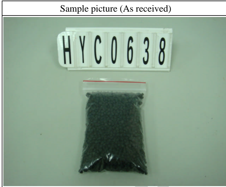
Sample picture (As received)